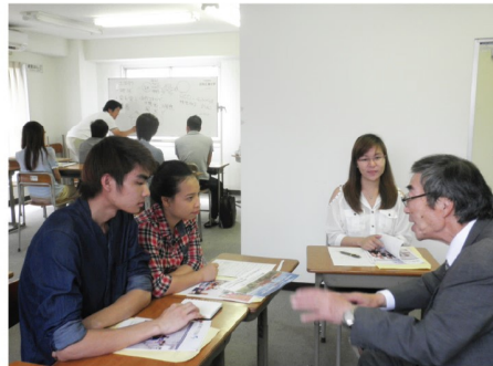
◀ University Seminars

Shinwa has classes tailored to giving students experience from teachers who have graduated from famous universities in Japan. We have implemented special comprehensive evening classes to higher-level students to prepare for entering graduate school that focus on guidance and the entrance preparation exam, the EJU. These classes give students the opportunity to further their knowledge on university enrolment and aid students in making sure they are well prepared, easing the stresses and possible anxiety students may feel. Students are also able to discuss their queries or concerns with any of the teaching or office staff regarding their application or any aspect of their life in Japan to make sure their time is as stress-free as possible to enable them to focus on their studies.