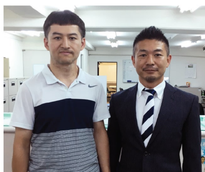
< Qualified to enter Tokyo Medical & Dental University