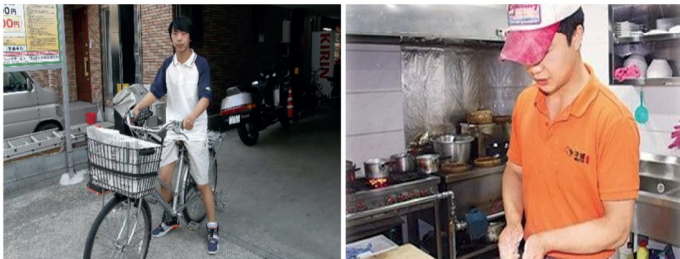
Work Seminar ➤