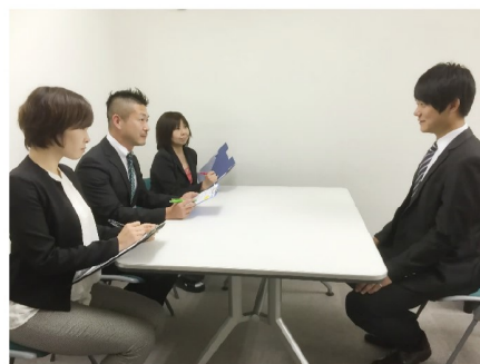
▲ University practice interview