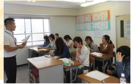
▲ Student's daily kanji test

At the beginning of each day there is a kanji (Chinese characters) test taken from vocabulary learned the day before. There is also a weekly review test and at the end of each semester there is a final test that enables successful students to graduate the class and move up to the next class. Classes are broken down into four parts a day, reading and writing, speaking, listening, and vocabulary. Students also receive daily homework assignments to help them retain and practice the Japanese they learnt. The faculty will always guide and support students who need help.