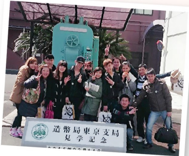
Tokyo Mint Visits