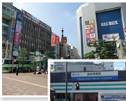
▲ Takadanobaba Station Front

* Fees include textbooks, papers & materials. * Tuition, facilities & textbook fees are not refundable after payment has been made.