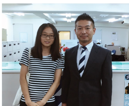
Qualified to enter > Chiba National University