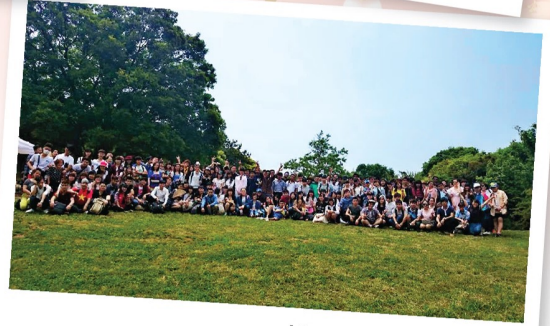
Kasai Rinkai Park