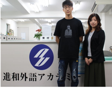
▲ Congratulations! Accepted into Tokyo University!

Experienced teachers prepare a curriculum tailored to the student's needs and objectives. Each class is organised by the students ability through meticulous tests upon enrolment, at the course's opening ceremony. Our new students will then attend an induction to prepare them for their life in school and Japan, giving them the opportunity to ask any questions or raise concerns they may have.