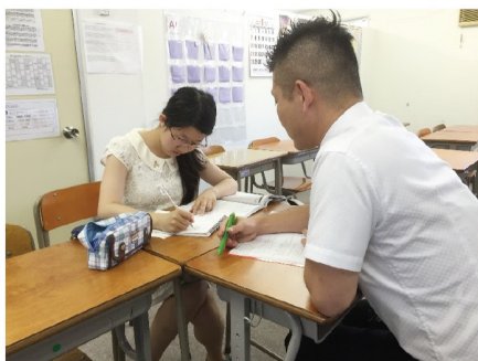
▲ University guidance counseling

Besides participating in Japanese classes, graduate school exam preparation lectures can be given to students wishing to take the entrance examination for University. Students also practice Japanese skills used in research, writing essays and research plans, and are given the necessary information to help them prepare for entering University. Teachers are able to give advice and help the students in writing their application forms as well as interview practice to best prepare students for their transition to their vocational school or university of choice.