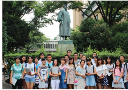
Waseda University Studies